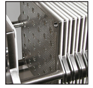
Plate and Frame Filter Presses

Laboratory Cylinder Filters are available with capacities up to 8000 ml.